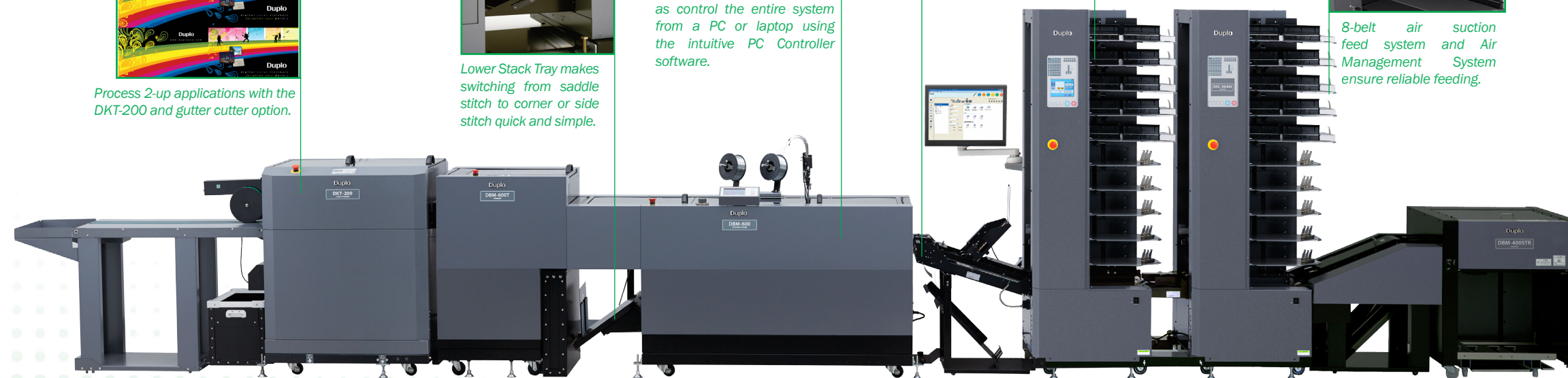
DBM-LSW Long Stacker