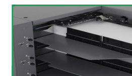
8-belt air suction feed system and Air Management System ensure reliable feeding.