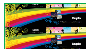
Process 2-up applications with the DKT-200 and gutter cutter option.