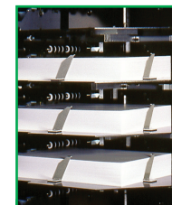
The 2.6" bin capacity supports a variety of paper stocks 52-300 gsm and paper sizes ranging from 4.1" x 5.8" to 14" x 24".

The integrated reject tray automatically diverts and collects sets that have missing or double fed sheets.