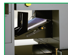
Lower Stack Tray makes switching from saddle stitch to corner or side stitch quick and simple.